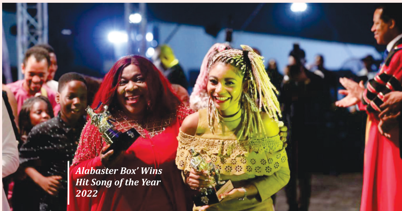
Alabaster Box' Wins Hit Song of the Year 2022