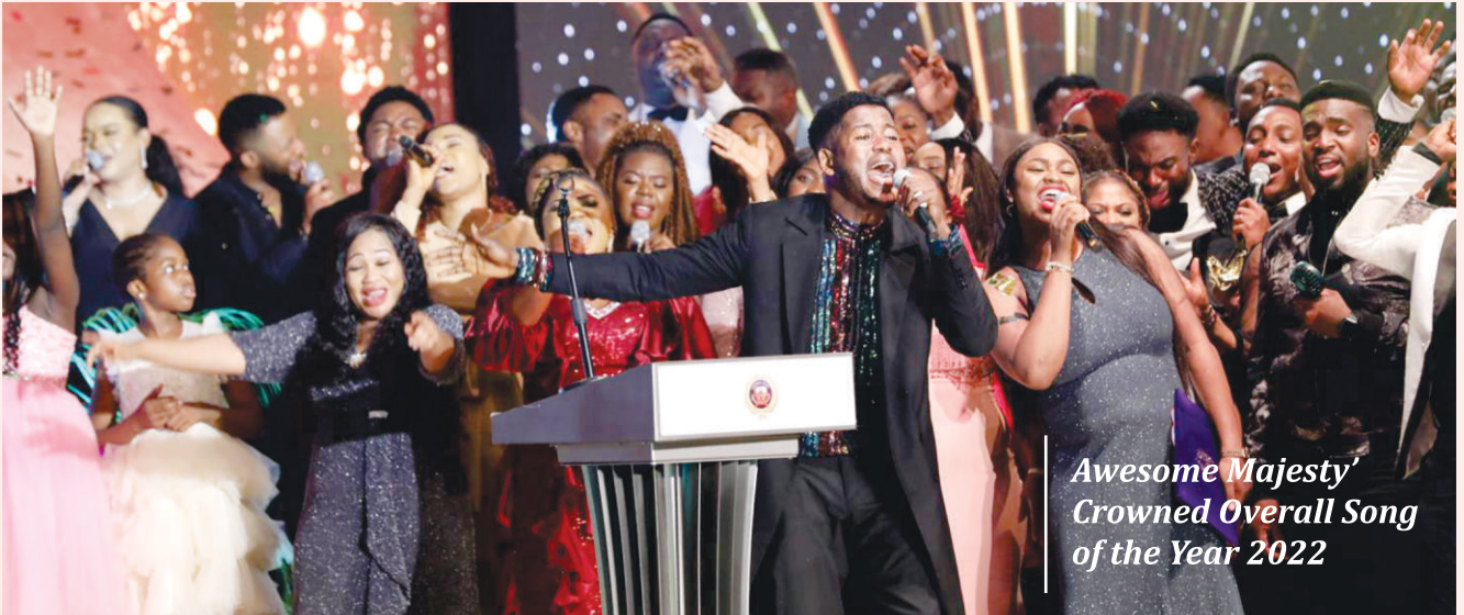
Awesome Majesty' Crowned Overall Song of the Year 2022