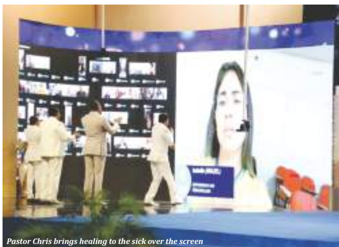
Pastor Chris brings healing to the sick over the screen

Through “Atmosphere for Miracles”, Pastor Chris exposed millions of households to the healing power of Jesus Christ as demonstrated in his own life and ministry. For 25 years, hope and faith have been ignited in the hearts of viewers who have seen the dumb speak, the deaf hear, the lame walk, the blind see, and even the dead raised back to life. Again, criticized by some concerning this, but the testimonies speak for themselves, some so undeniable in their impact that entire communities have borne witness.