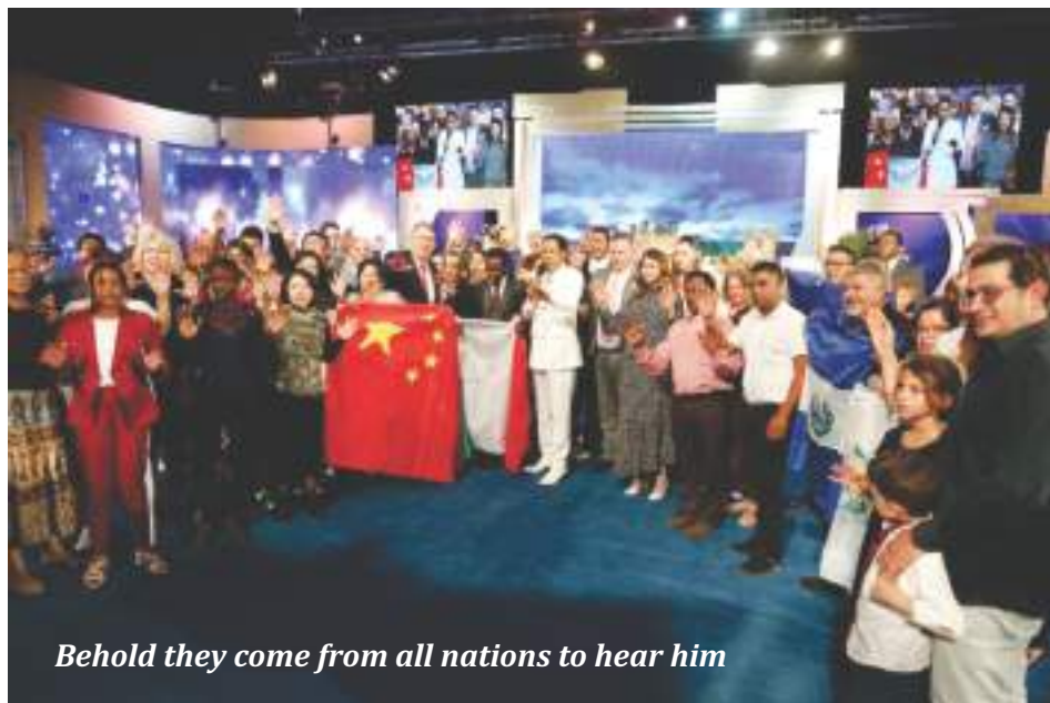
Behold they come from all nations to hear him