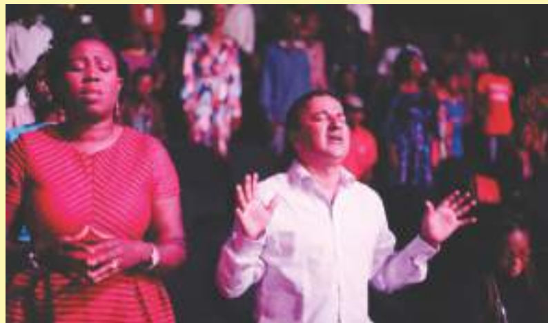
In worship of God

Station in this year of the Gathering Clouds raising the standard in the engagement of her respondents which resulted in the birth of Outreach Centres in four prominent Arab nations - Iraq, Jordan, Israel and Lebanon.