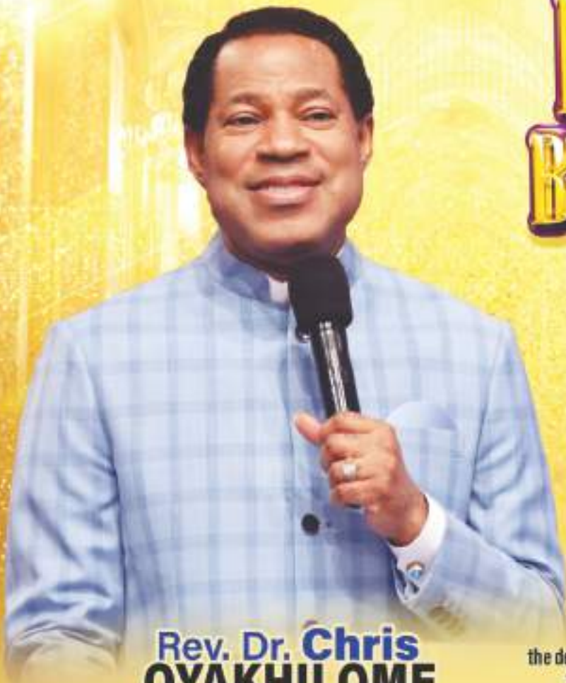
Rev. Dr. Chris OYAKHILOME President, Loveworld Incorporated

Some read of super heroes in comic books and such. We were raised by a real one.