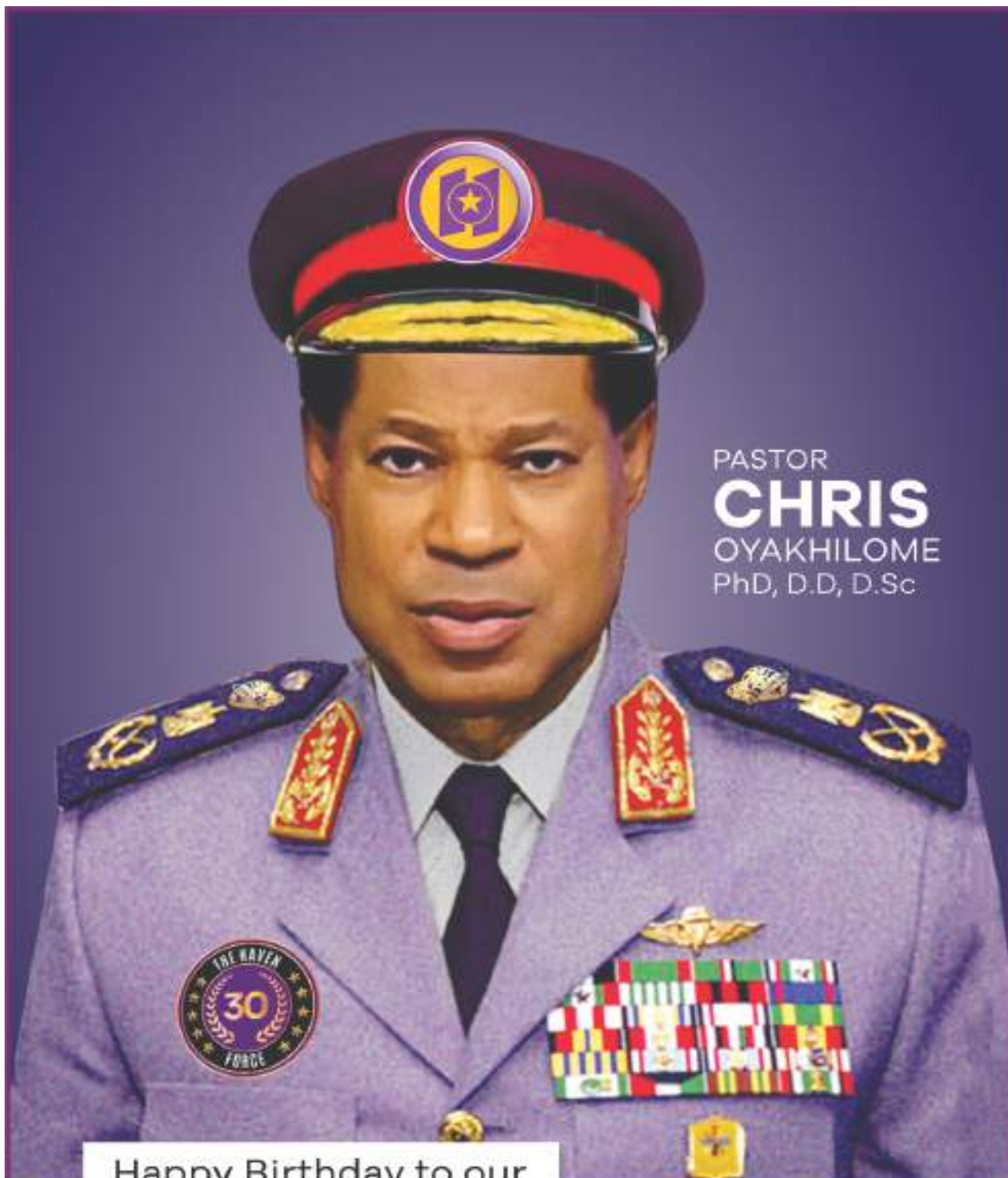
PASTOR CHRIS OYAKHILOME PhD, D.D, D.Sc